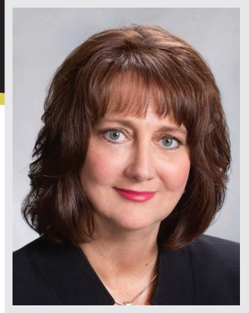
The Honorable Judge Deborah Alessi 11th Judicial Circuit Court, Div. 2 in St. Charles County, MO www.sccmo.org